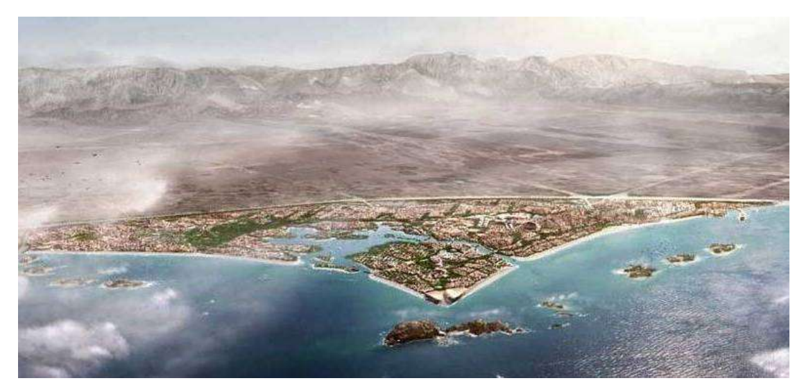
Al Madina A' Zarqa, Oman, Master Plan-Aerial View - (Foster & Partners)

STRUCTURAL DESIGN: OMAN 2007 JV, KANON CONSULTING, (2007-2010)