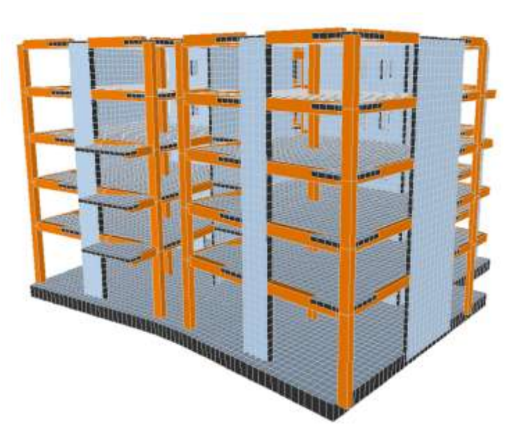
SAP 2000 Structural Model of a typical apartment building