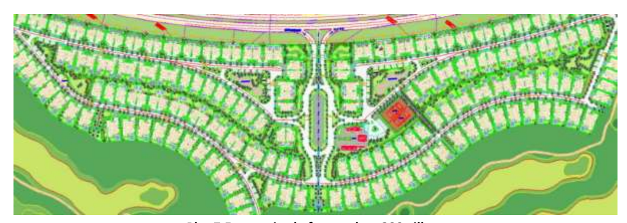
Plot 7.5 comprised of more than 200 villas