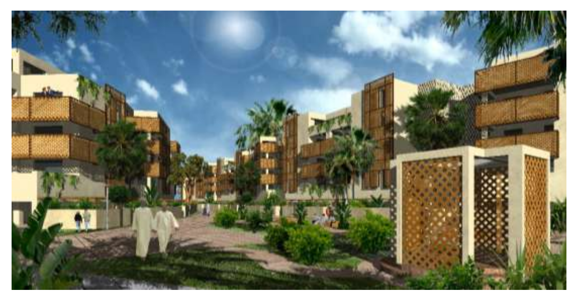
Architectural Visualization of an apartment building neighbourhood